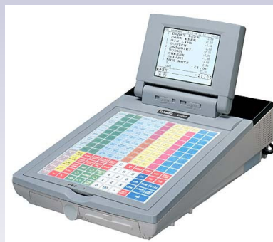
Casio QT-2100 POS Terminal