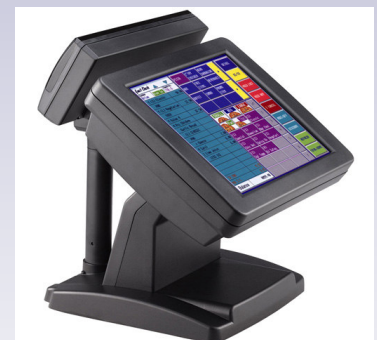
Touch Screen Terminal