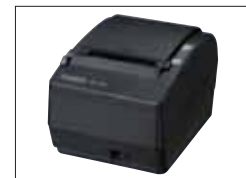
Casio UP-400 Ethernet RS232 Printer