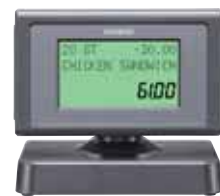
Optional Remote Display

Casio has two optional, heavy duty, black cash drawers for the QT-6600. The DL-2324 is a smaller drawer with a 5 bill/5 coin removable till for less demanding operations. The DL-3622 is the larger cash drawer for more demanding applications with a 6 coin/5 bill removable till. An optional extension cable, MDL-11, is available to remotely mount the cash drawer from the terminal.