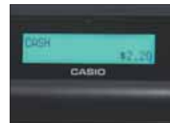
Built-in 2 x 20 Customer Display