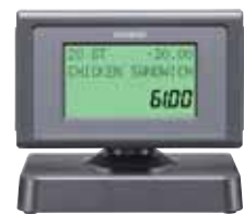
Optional Remote Display

Casio has two optional, heavy duty, black cash drawers for the QT-6600. The DL-2324 is a smaller drawer with a 5 bill/5 coin removable till for less demanding operations. The DL-3622 is the larger cash drawer for more demanding applications with a 6 coin/5 bill removable till. An optional extension cable, MDL-11, is available to remotely mount the cash drawer from the terminal.