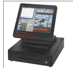
DL-2434 Cash Drawer