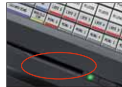
Magnetic Stripe Reader