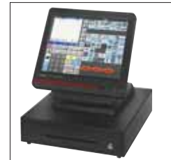
DL-3622 Cash Drawer