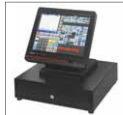
DL-3622 Cash Drawer